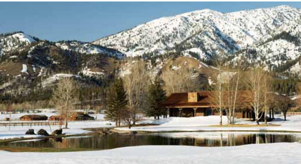
Above: The homes that line the runway at Alpine Airpark have stunning views. Below: Landing on Rwy 13; the airport is often the first in the area to be cleared of snow.

Your flight to Alpine will remind you what a world without chaos could be. Once you step away from your airplane, your only mode of transportation will be your snowmobile, or your own two feet. The town of 750 may be small, but it's bursting with snow-covered mountain charm, friendly and accommodating folks, and outdoor thrills. Snowmobile at heart-pounding speeds, or take your time and marvel at the elk and the moose. Snowshoe or ski through the backcountry with or without a guide. Whether your adrenaline meter registers way above wild, or settles comfortably around mild, get ready for an adventure.