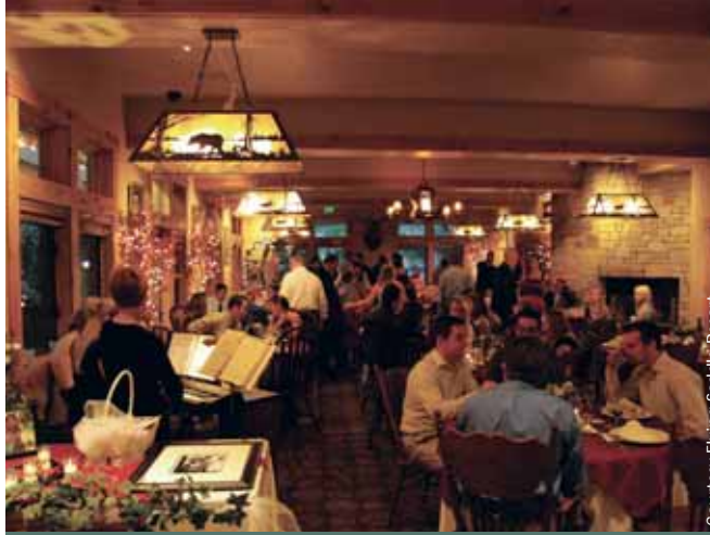
The Flying Saddle Steakhouse offers a fine dining experience in Alpine and serves an impressive array of steak and game.

If you're hitting the trail on your snowmobile, head down the Greys River trail to